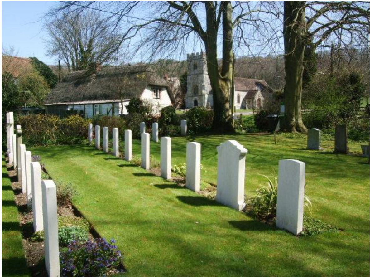
St. Mary's New Churchyard, Codford