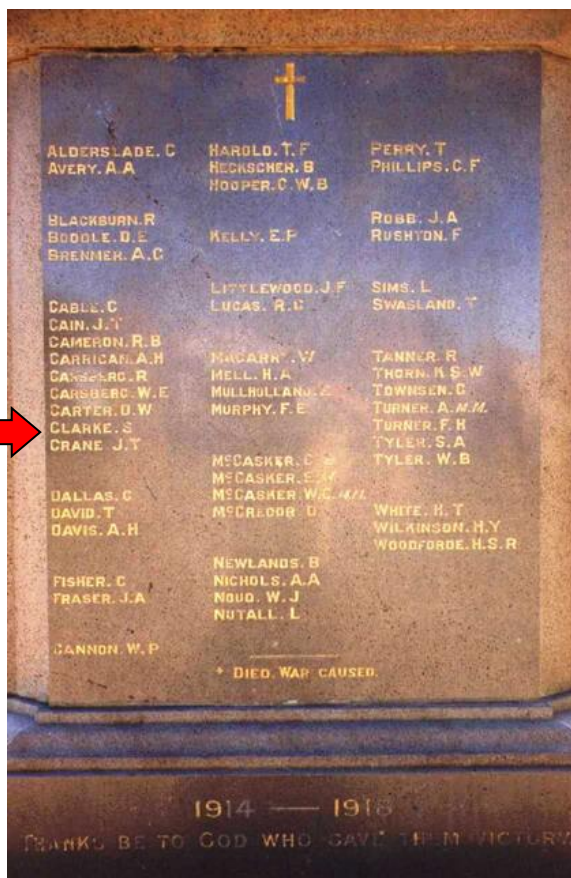
Goondiwindi WW1 War Memorial